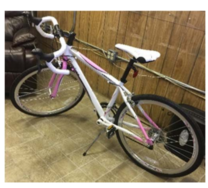
Professional Equipment Repair donated this bike for PPD's United Way BBQ raffle.